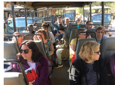
Game Drive Jeep