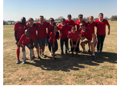
Group Soccer Game